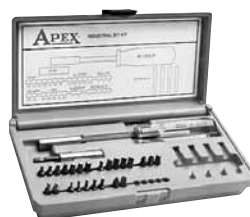
24 Bit Kit